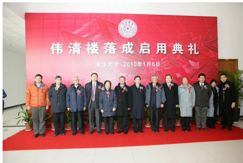
The opening ceremony of the “Weiqing Building”